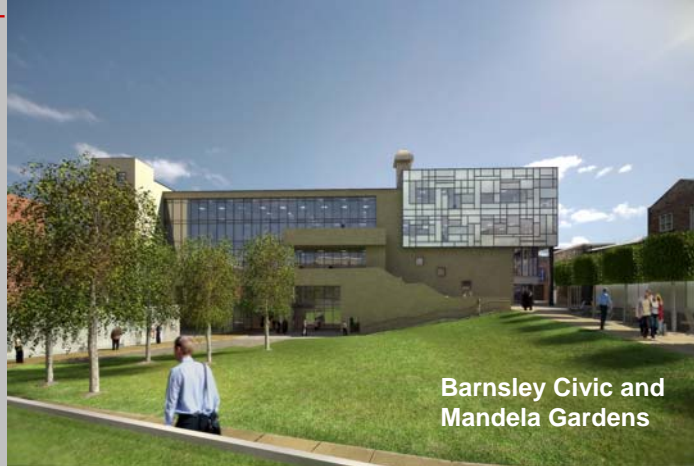
Barnsley Civic and Mandela Gardens

Will the result enhance or damage the quality of the townscape?