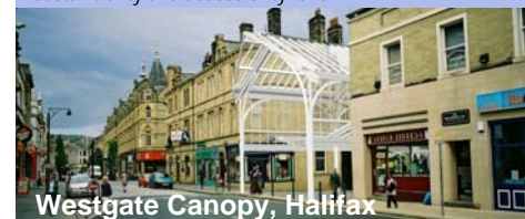
Westgate Canopy, Halifax