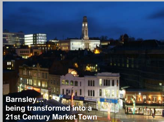
Barnsley... being transformed into a 21st Century Market Town