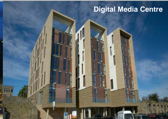
Digital Media Centre